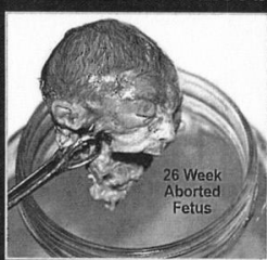
26 Week Aborted Fetus